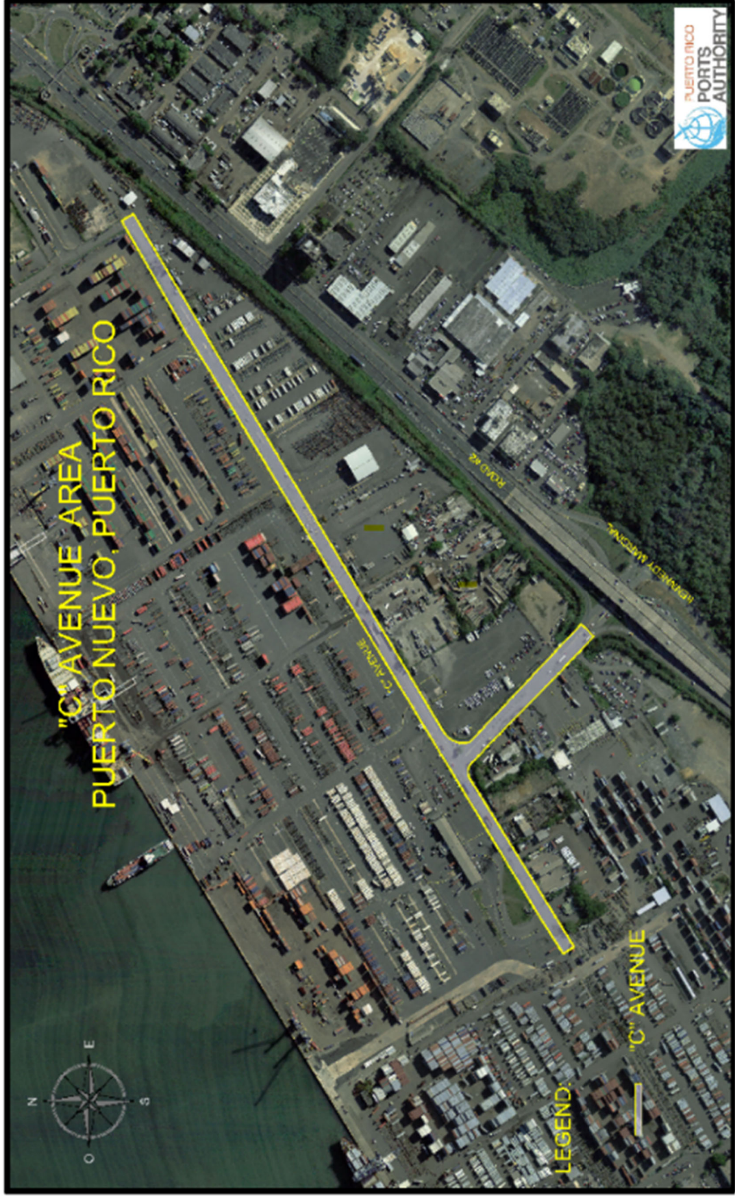
Exhibit 3 Project Layout